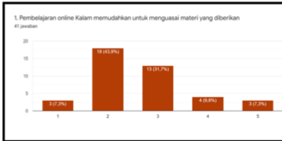
Picture1. Online learning Kalam makes it easy to master the material provided

Based on the results of research from 41 students, the data shows that 43.9% (18 students) of the students answer disagree if online learning Kalam made it easier to master the material provided and 31.7% (13 students) answer agree with the statement and 9.8 % (4 students) said quite agree and 7.3% (3 students) answer strongly agree while only 7.3% (3 students) answer strongly disagree with the statement above. It means that online learning Kalam does not make it easier for students to master the material provided.